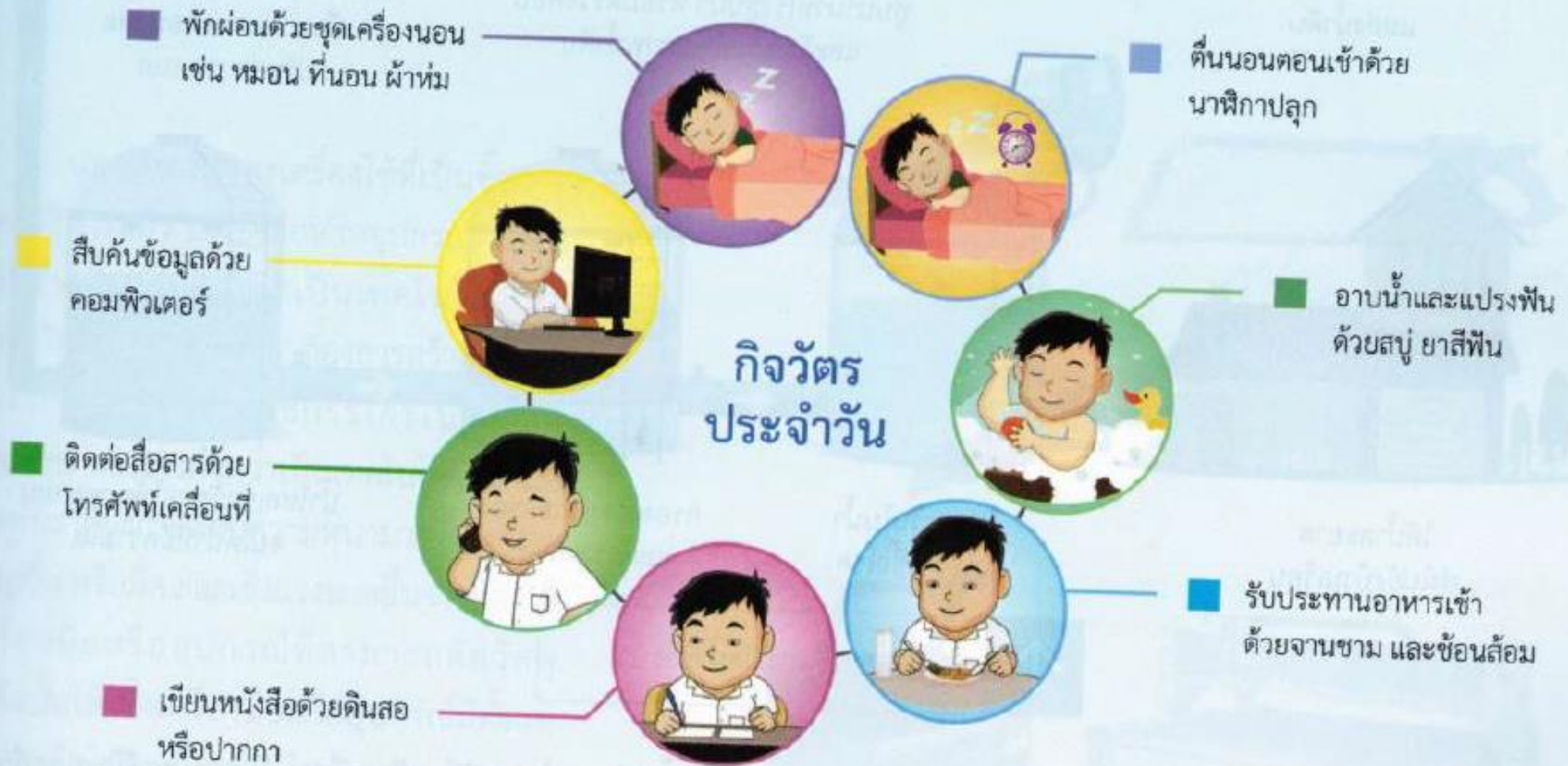
↑ รูป 1.1 สิ่งของเครื่องใช้ที่เกี่ยวข้องในกิจวัตรประจำวัน